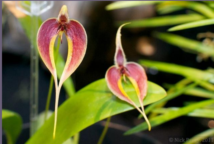
MOS 2011 Show photography by Nick Pavey.