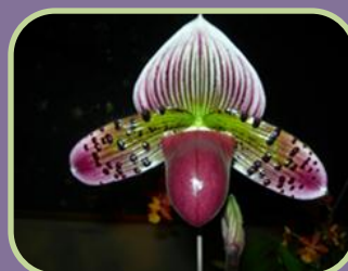
Paph. Macabre X Nighthawk