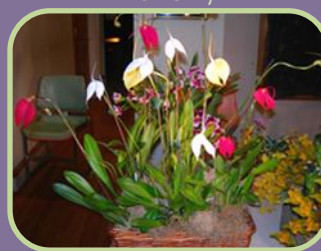
Basket of Masdevallia coccinea