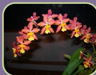
Onc. Chrysomorphum X Oda. (Clenedebourne Cherubino X Weavside Pattern)