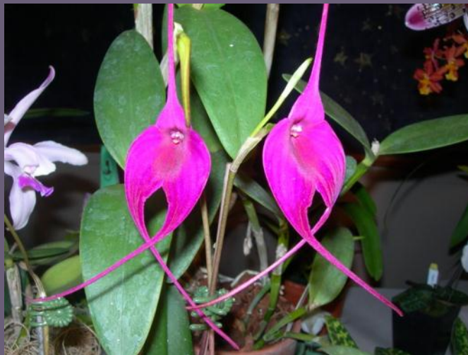
Show table