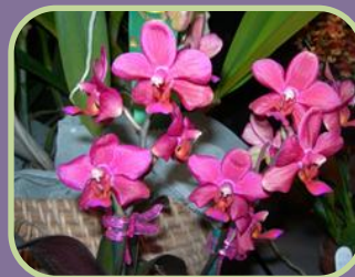
Phal. Lava Glow