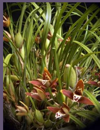
Maxillaria tenuifolia ( Maxillariella tenuifolia )

Please note that the June meeting will be held on June 7 th , the first Tuesday in June.