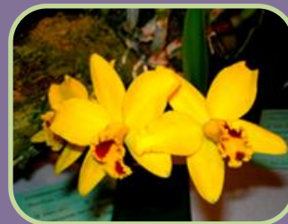
Slc. June Bug