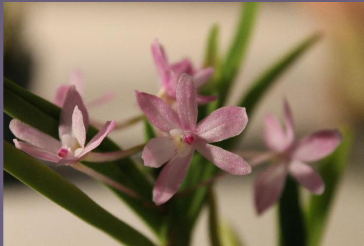
Show table photography by Brigitte Fortin.