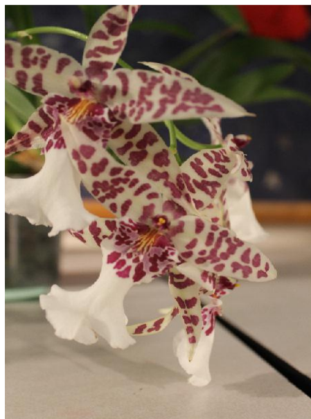
Blira. Hawaiian Glacier 'Queen Anne'

In an effort to get our meetings started by 7:30, we kindly request that show table plants be ready for judging by 7:15pm.