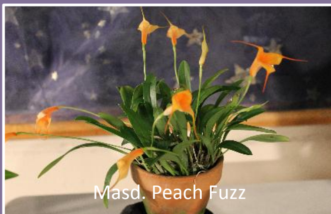
Masd. Peach Fuzz