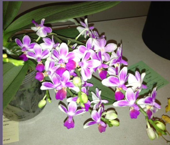
Show table photography by Brigitte Fortin.