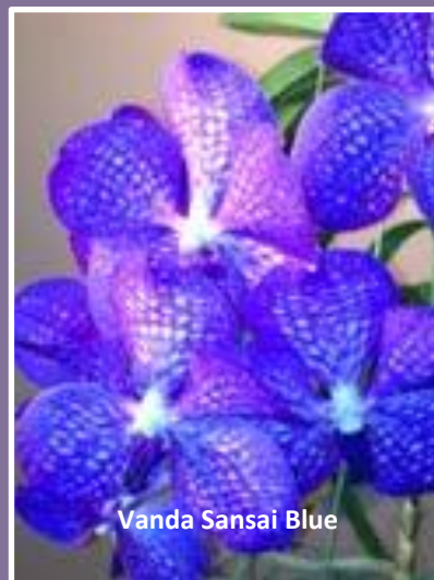
Vanda Sansai Blue