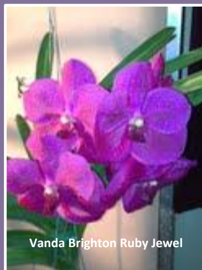
Vanda Brighton Ruby Jewel