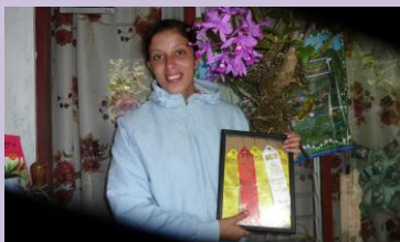
Jardin des Orquideas San Bosco