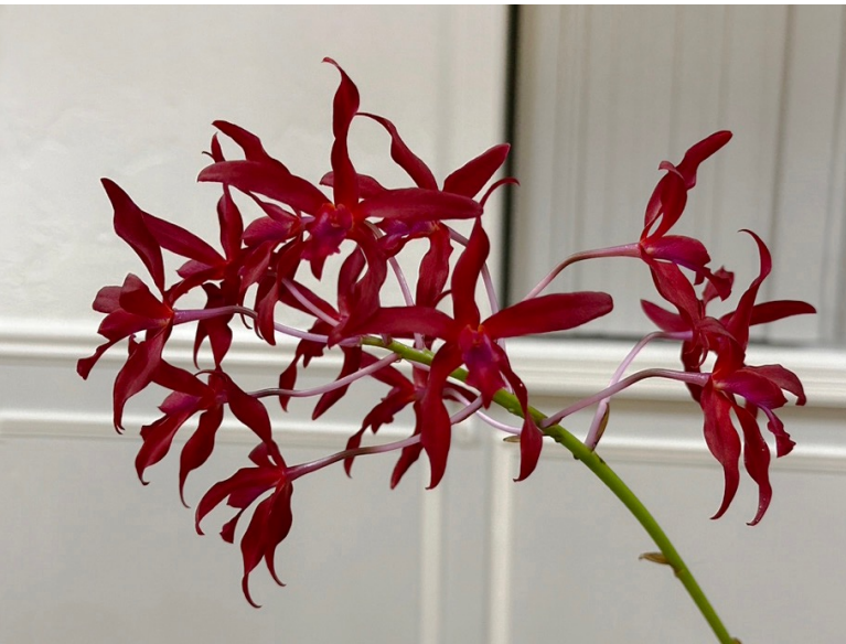
Schombolaeliacattleya Newberry Lavaburst 'Glow'