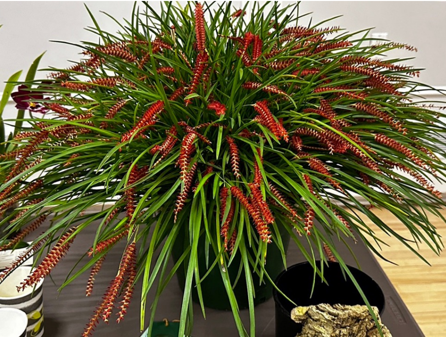
Dendrochilum wenzelii 'Cooper', CCE/AOS, Daryl Y.