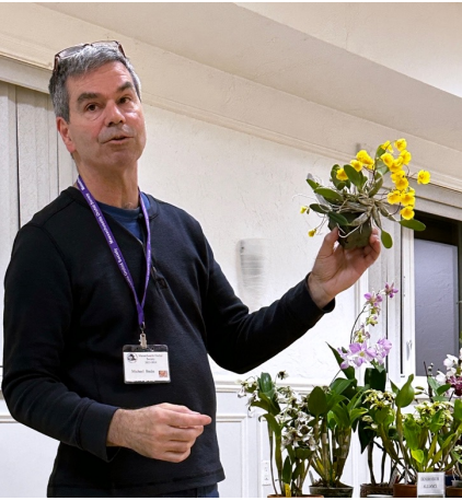
Cultural observations from Mike