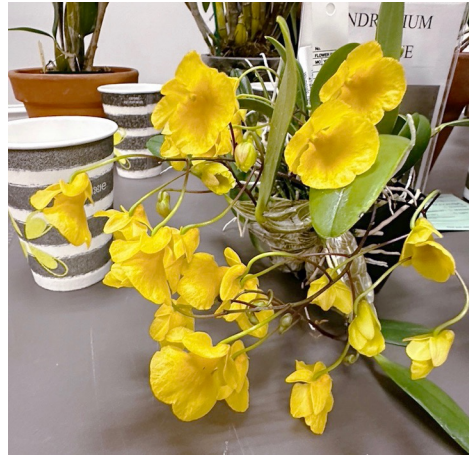
Den. jenkensii x aggregatum, Brigitte F.