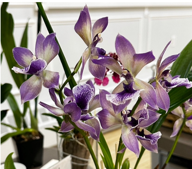
Zygonisia cynosure 'Blue Bird'