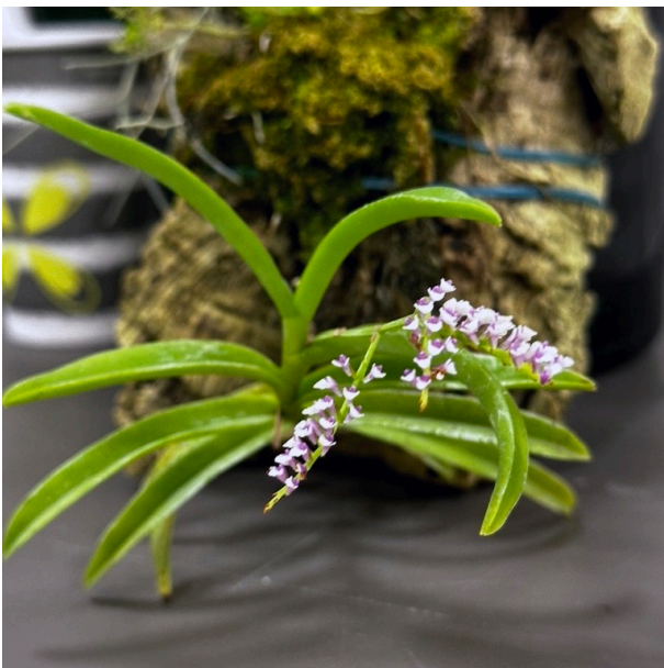
Schoenorchis gemmata, Daryl Y.