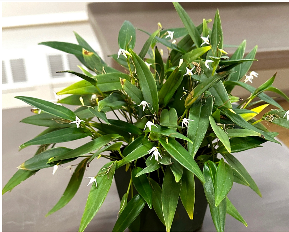
Pthys. eumecaulon 'Snow Angel', Daryl Y.