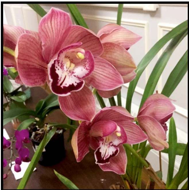
Cymbidium, Ellen Shapiro