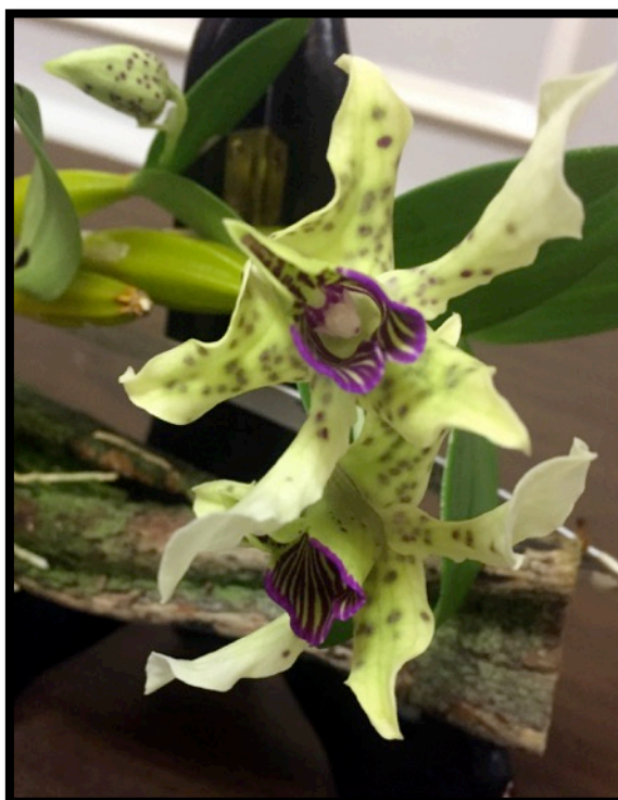
Den normanbyense